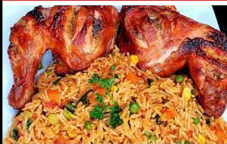
FRIED RICE WITH GRILL CHICKEN