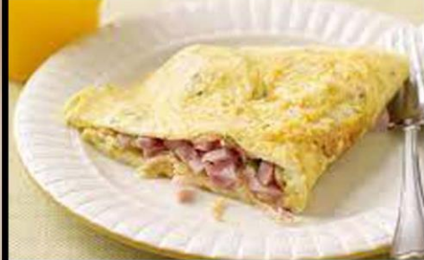
HAM & CHEESE OMELET