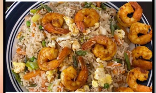
MIXED FRIED RICE