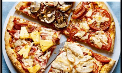
FOUR SEASON PIZZA