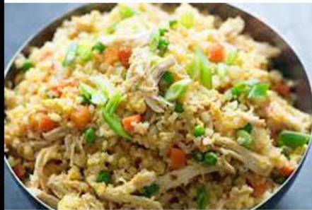
CHICKEN FRIED RICE