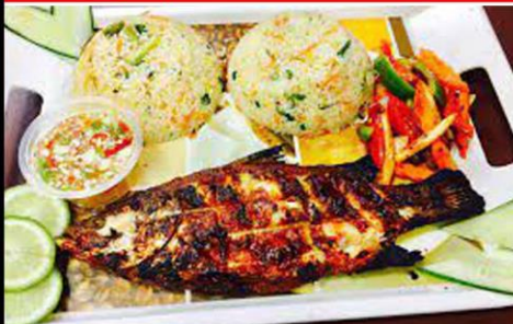
FRIED RICE WITH GRILL FISH