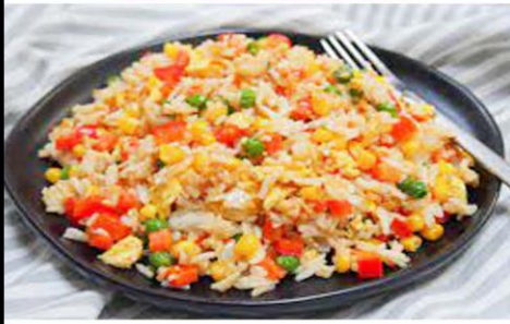
VEGETABLE FRIED RICE