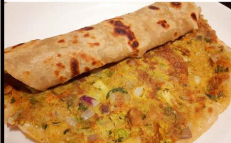
CHAPATI & EGG