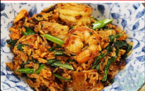
ALVINO SPECIAL FRIED RICE