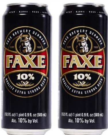
FAX BEER 10%