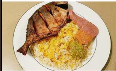
DRY RICE WITH FISH/CHICKEN