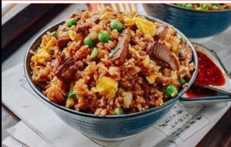
BEEF FRIED RICE