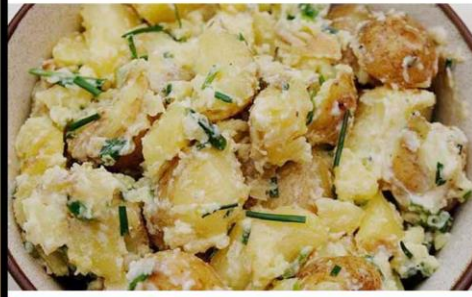
IRIASH POTATOES SALAD